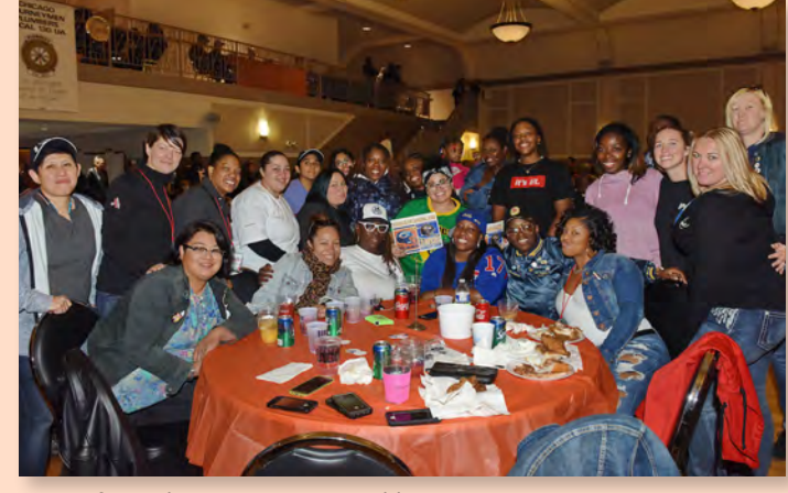
Guests from Chicago's "Women Build Nations Convention".